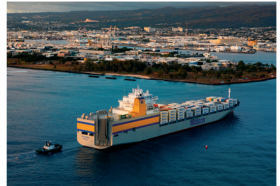
Matsonia pulls into Honolulu Harbor in early January 2021.

Since our company became public in 2012, our focus on ROIC has produced a nearly 3.2x increase in the book value per share, a compounded annual growth rate of 14.7%. 1