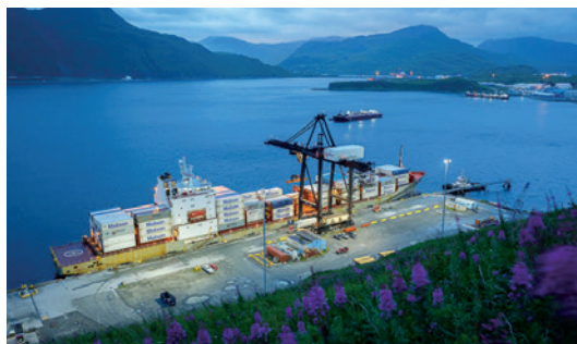
Matson's terminal operations in Dutch Harbor, Alaska, the hub of its new Alaska-to-Asia Express (AAX) service.

In my 2019 CEO letter, I noted that we expected to realize $40 million within two years in annual financial benefits from the new vessel and infrastructure investments listed above. 3 I am pleased to report that we achieved in excess of $30 million of our target in 2020, with the greatest contributor being the redeployment of the Aloha Class vessels to our CLX service, and we expect to achieve at least the balance ($10 million) in additional annual benefits in 2021.