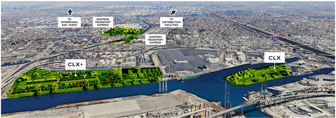
An aerial view of Matson's Long Beach, California port operations.