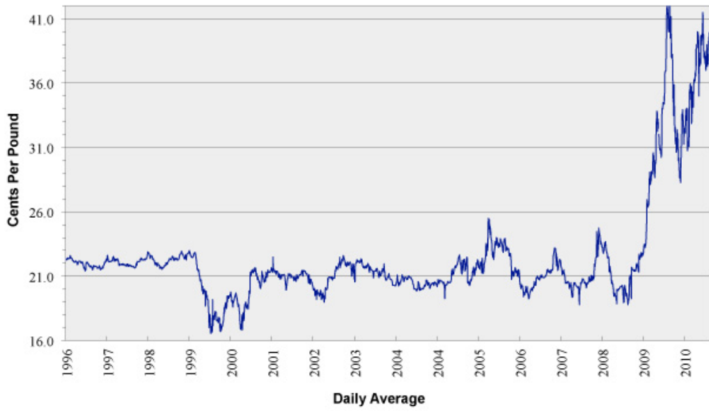
U.S Raw Sugar Prices (New York No. 16 Contract)